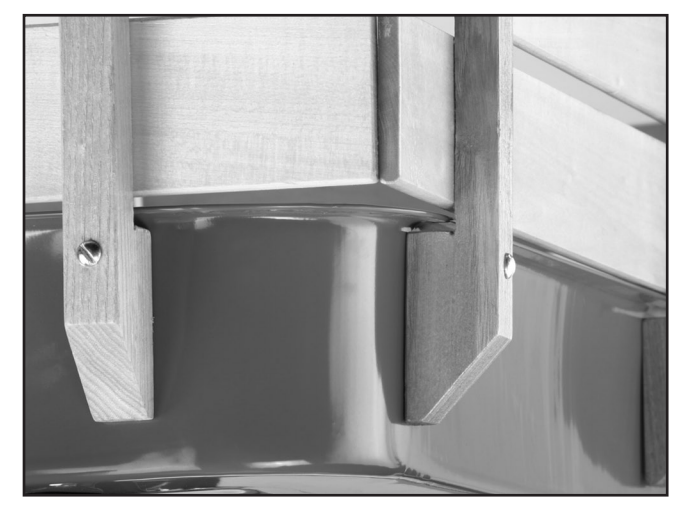
Figure 3. Wood stake side mounted to the outside of the bed.